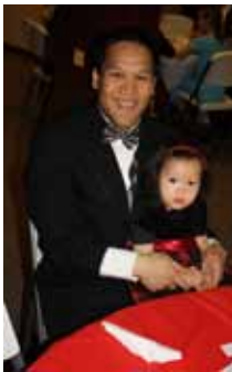
Father/Daughter Valentine's Banquet