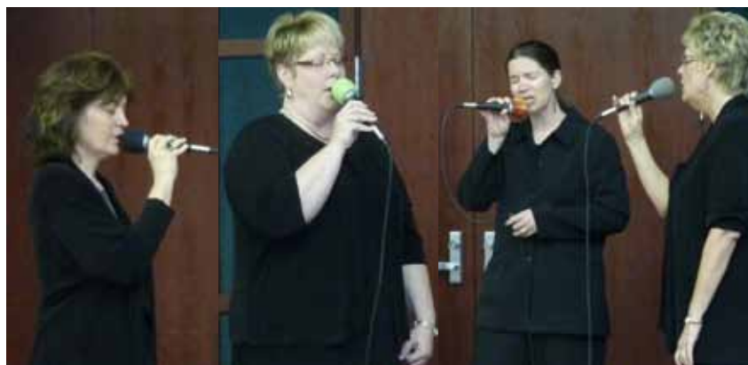
Silk Cords entertain at the Women's Brunch on April 17.